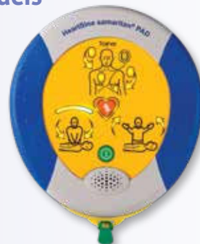
samaritan PAD 500P Trainer with CPR Rate Advisor Simulation (TRN-500-xx)